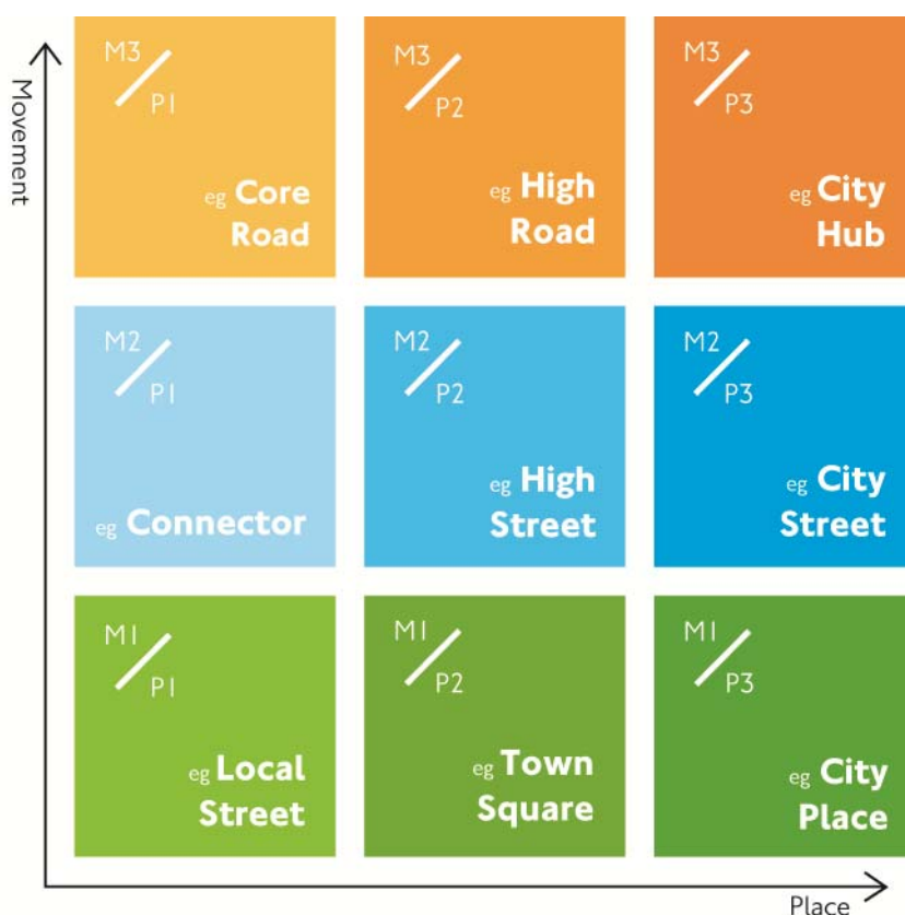
Figure 1.0 Functional Street Type matrix