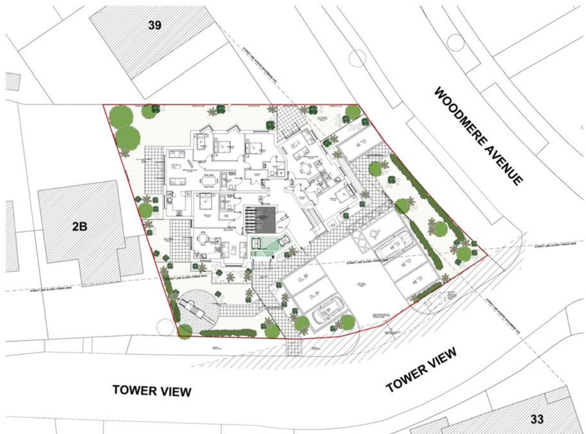
Fig 2: Proposed Site Plan

8.12 In relation to the local area, whilst the dwellings to the South (Tower Hill) are mostly single storey, those that lie opposite the site on Woodmere Avenue (numbers 52-62) are two stories in height and generally display hipped roof forms combined with dual pitched gable ended features (eg bay windows).