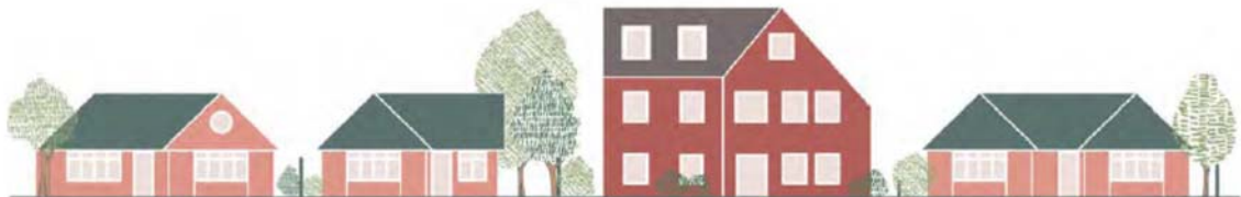
Figure 2.10d: Where surrounding buildings are predominantly single storey, new development should seek to accommodate a third storey within the roof space.